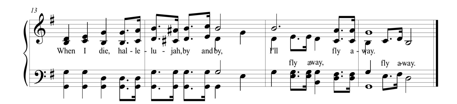
+++ LITURGY OF THE EUCHARIST +++